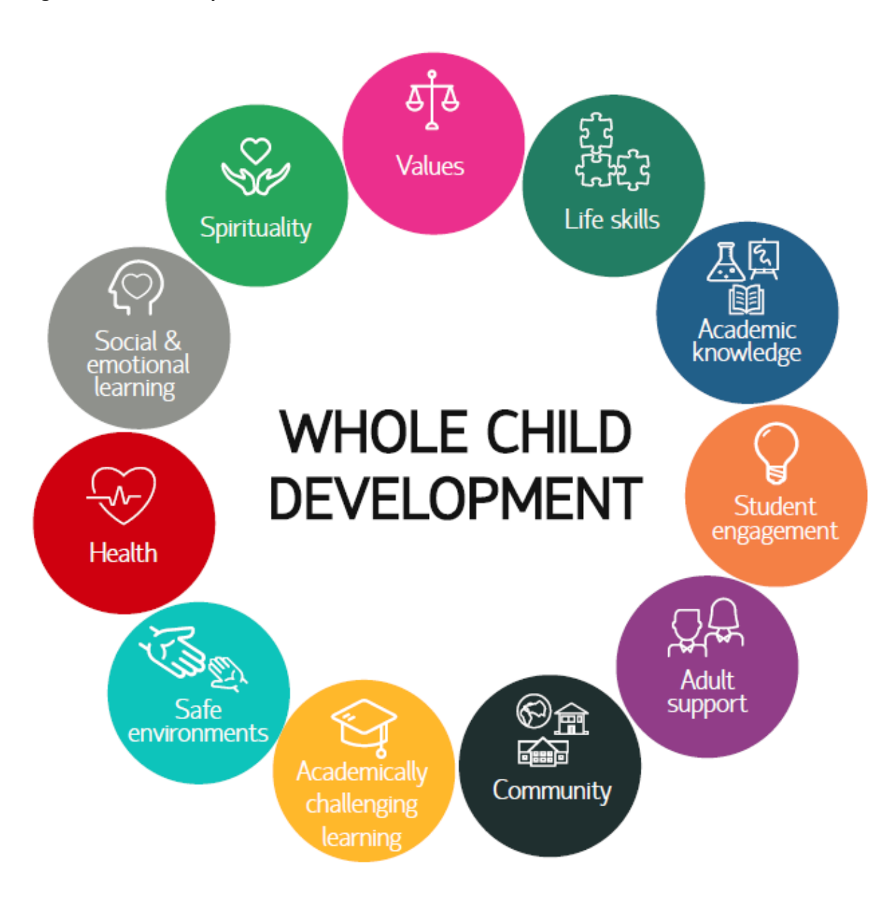
Figure 1 WCD conceptual framework themes

The conceptual framework, which was developed as part of this study, was informed by WCD approaches identified in the literature, such as the ASCD whole child approach and Porticus' lens of WCD. It was also guided by the policy documentation provided by sites and informed by their responses to the policy survey questions. While it was not the intent of this study to derive or impose a definition of WCD, for a policy level analysis to be valid, reliable and comparable, some broad parameters around concepts were applied. The policy documentation informed the dominant themes and terms relating to WCD, including for example, social and emotional learning, 21<sup>st</sup> century skills, transversal competencies and life skills. The study also focussed on identifying the key factors relating to extreme adversity. ACER identified 11 dominant themes that formed the basis for this study.